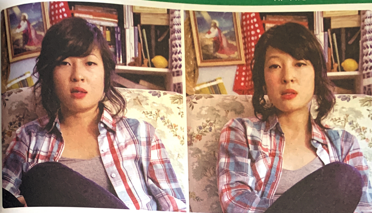
Factum Kang, 2009